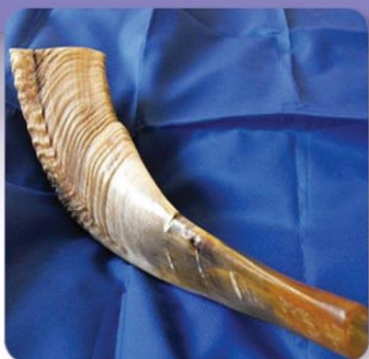
Ornament Ram's Horn Trumpet