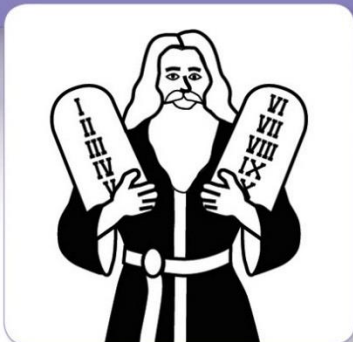
Ornament Tablets of the Torah