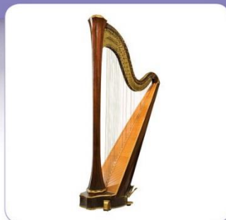
Ornament Shepherd's Crook or Harp